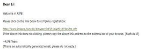
3. Click the link to confirm after receiving the confirmation email