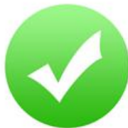
4. Complete the registration