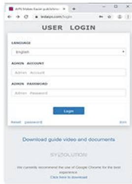
1. Click the "Register" button

When you have not applied for the management account of the AIPS platform for the first time, please click the "Register" button, enter the relevant information, log in to the mailbox filled in during registration. After receiving the confirmation email, click the link in the email (or copy to your browser to open), and complete the registration.